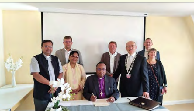
Visiting Mayor Office, Germany