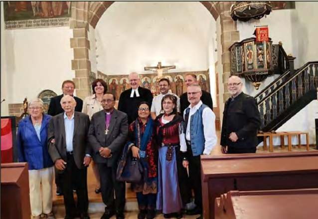
After Sunday Service.