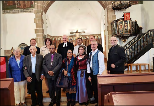
After Sunday Service.