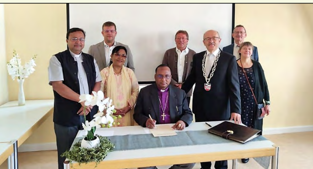
Visiting Mayor Office, Germany

God and thank the German Government for choosing such as excellent loving and friendly Mayor.