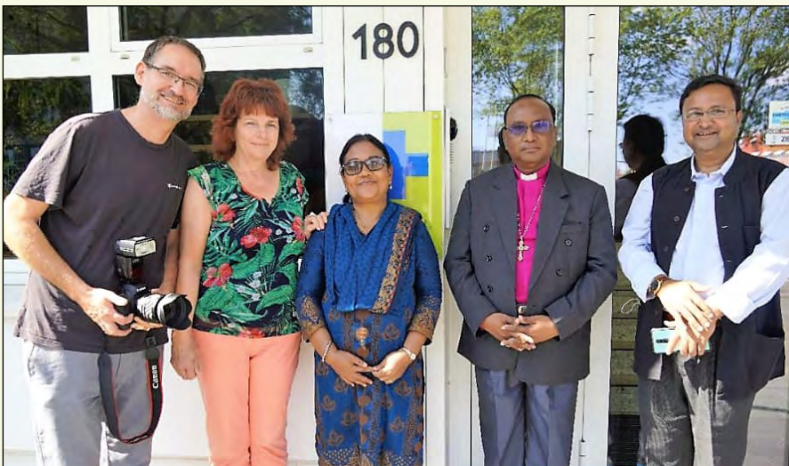
Visiting KNH Office, Germany