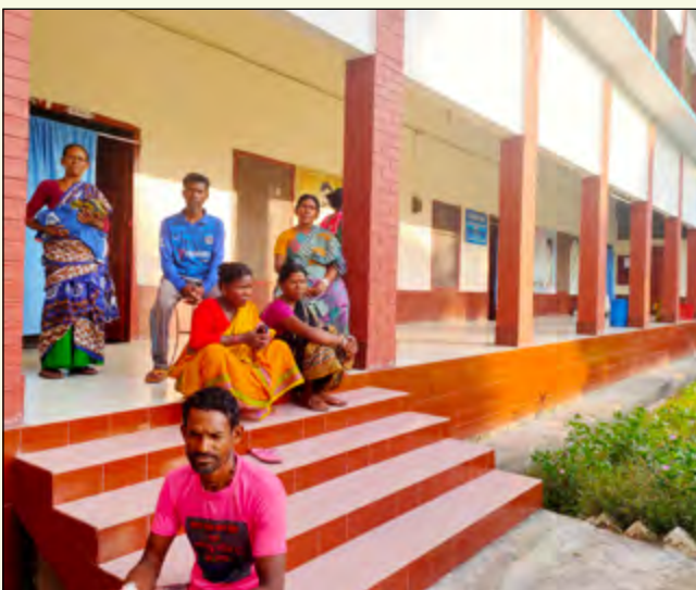
The people from ethnic community are seen as the attendants of patients inside the Children wards: Mission Hospital is trying to ease tension of the patient attendants.