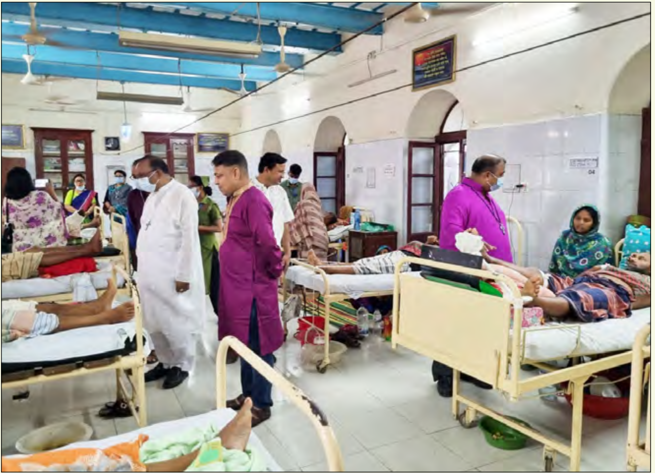
The daily health service in Male Ward of Christian Mission Hospital Rajshahi