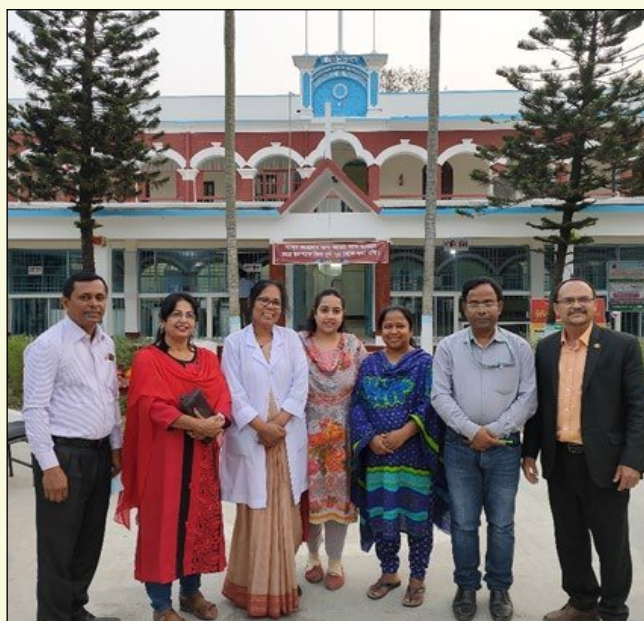
The High Official of the Bangladesh Adventist Nursing Institute-Bani came to visit the CMHR and NI of Rajshahi

At the end of the search for secured and normal delivery