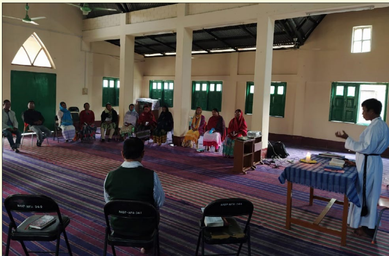
UMOJA Group Meeting and Bible Study in Haluaghat