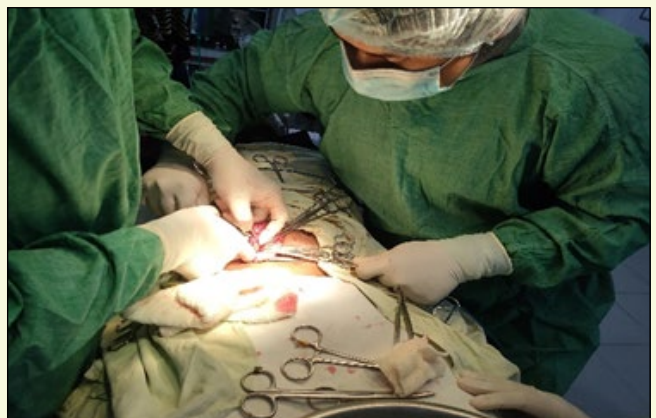
Operation theatre has been active after 1st February 2021.

We hope for the best to provide better and quality health service to the people and achieve self-sustainability. We request your prayer and blessings for this challenging journey.