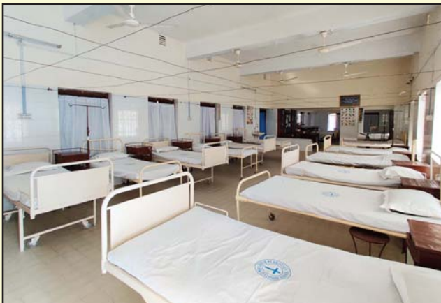
Beds have been made