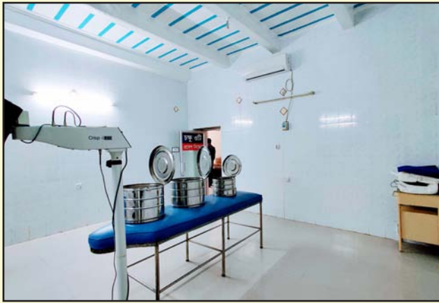
Eye operation theatre