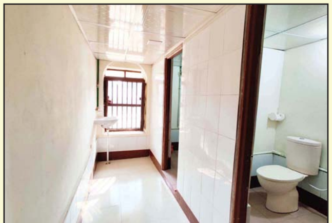
Two separate modern toilet facilities