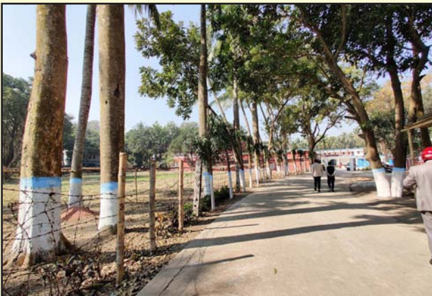
Environment Friendly Vegetable Garden of the Hospital