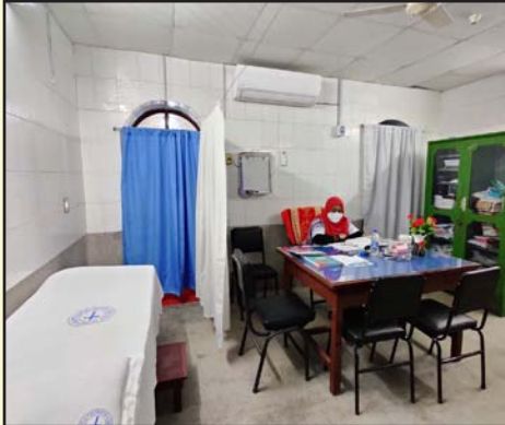
Female Doctor Room