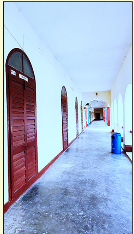
Female Ward corridor