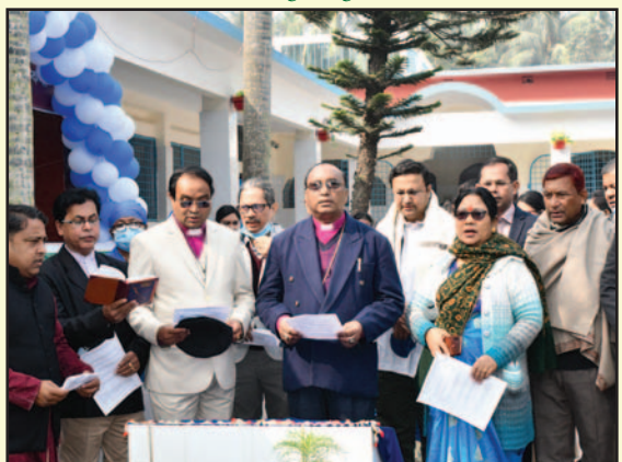
Inauguration by the Moderator