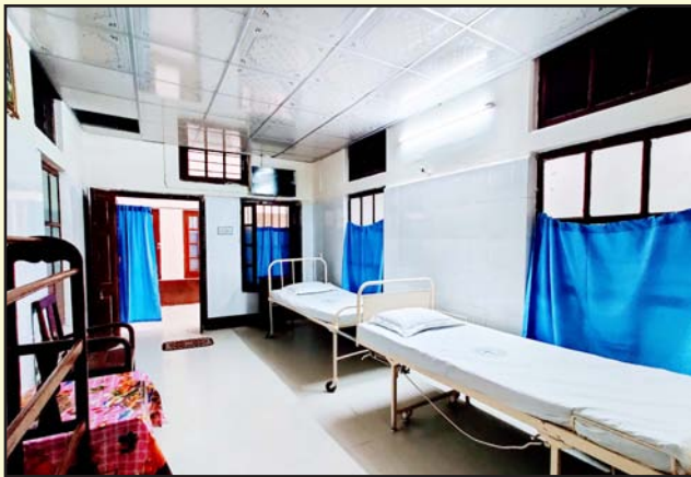
A cabin near the maternity ward