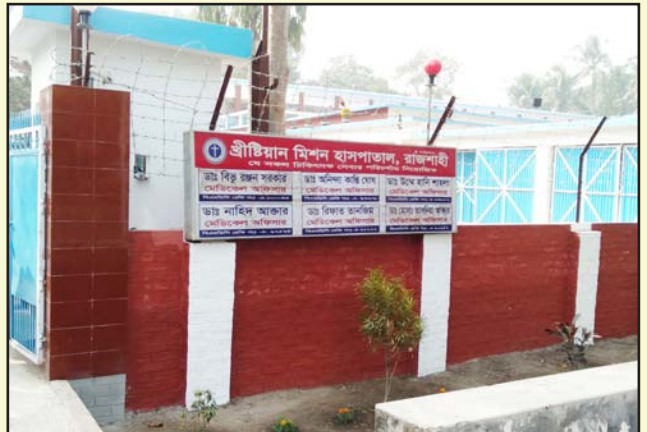
Doctor's list outside gate