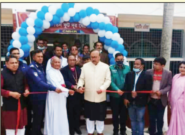
Cutting ribbon by the City Mayor