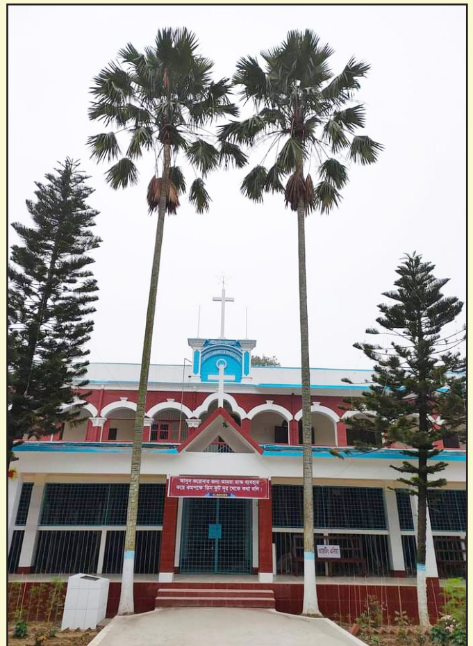
Christian Mission Hospital, Rajshahi