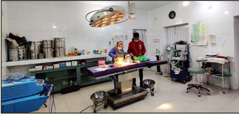
Enhanced OT capacity with light and tiles in the sitting area