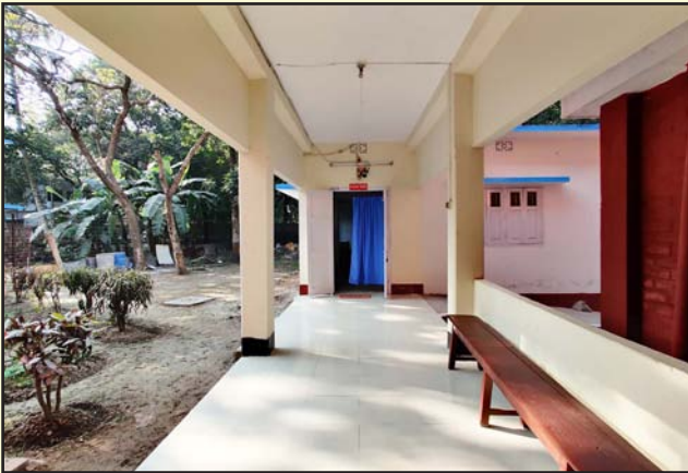
Passage to the the OT