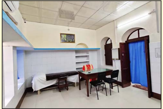
Orthopedic Doc room