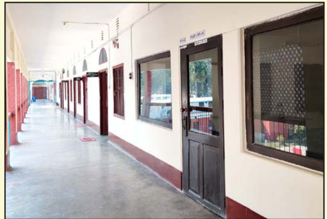
1st floor veranda