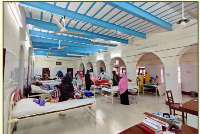
Busy male ward