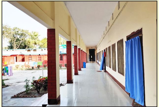
Veranda of Maternity Ward