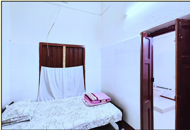
On call doctor's room