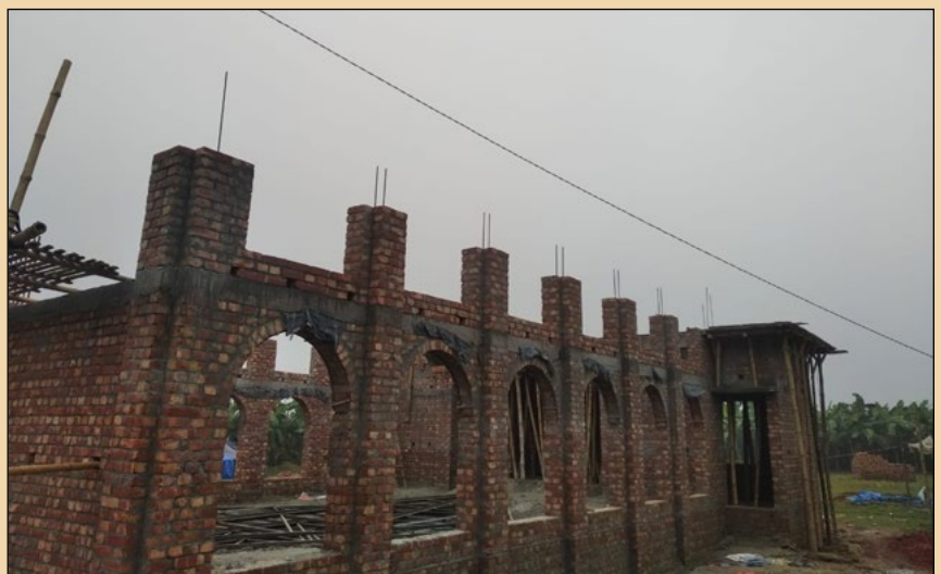
A blessed Church building at Shridampara is being constructed with the help of UTO