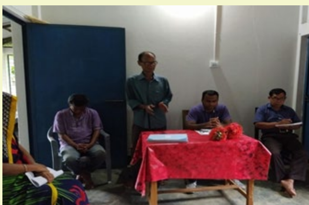
Meeting with the staff at Baraujani Clinic