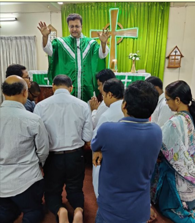
Commissioned students with blessings after completion of the course

Thanks God that we are in good health by the Grace of Almighty God during this COVID-19 Pandemic time. Our College set for the final B.Th. exam from 20 July to 31 July 2020. The online exam was held in SATC, Dhaka. Total 19 students attended the online exam. After completing the B.Th Final Year, College arranged farewell for outgoing students and sent them with blessings through the worship service on 27 th July 2020 for 11 Students as every year we do. We also gave them a good farewell with thanks for studying with St. Andrew's Theological College.