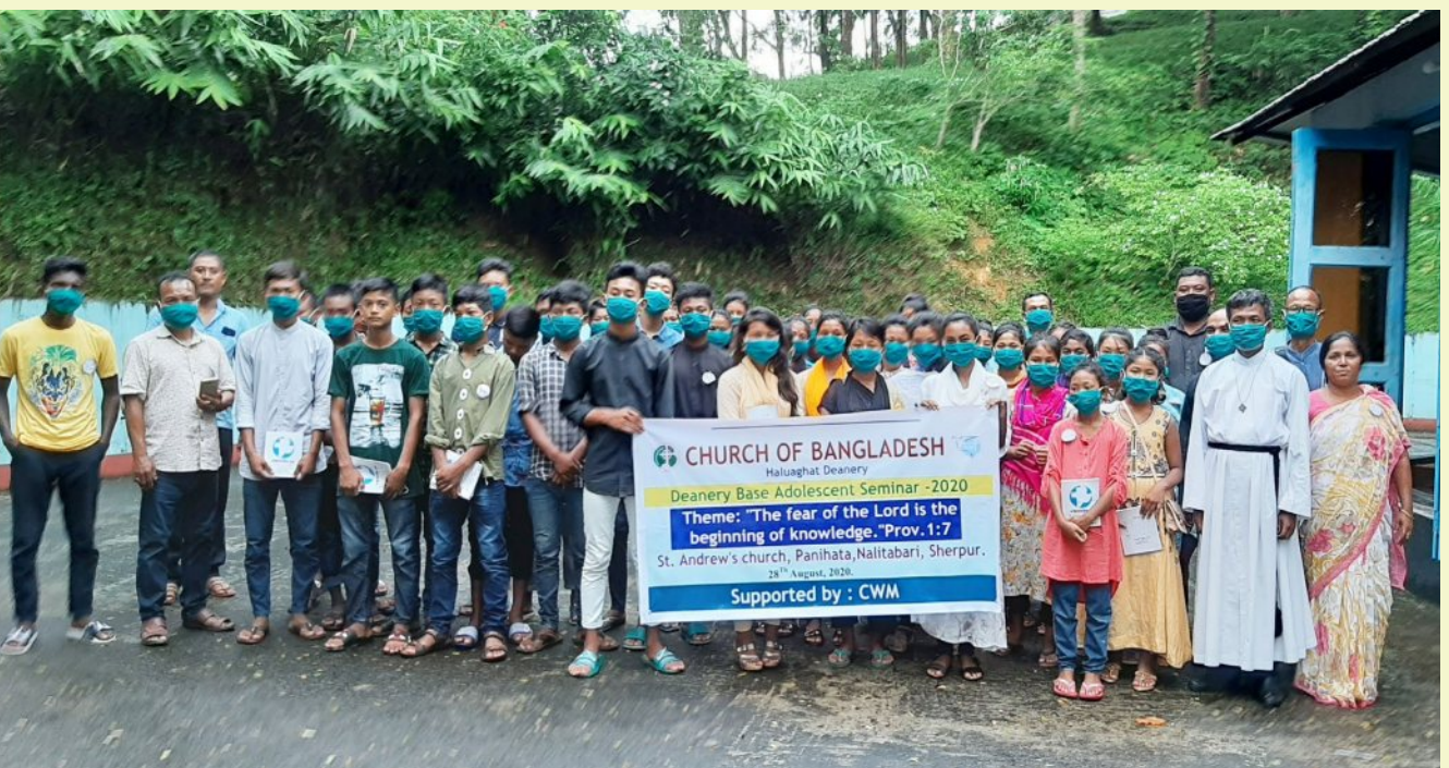
Adolescent Seminar held at Panihata by the financial support of CWM