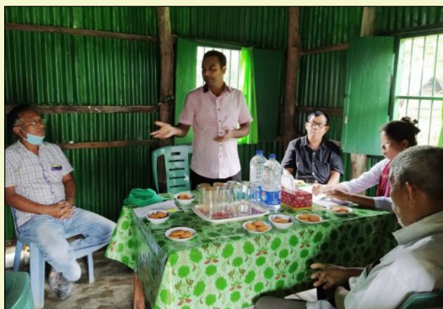
Meeting with staff and PMT members at Katalmari Clinic.