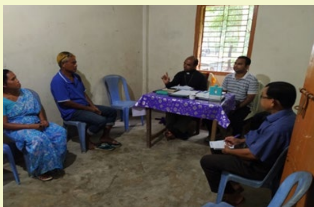
Meeting with staff and PMT members at Panihata Clinic.