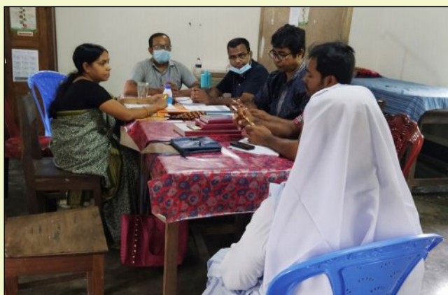
Meeting with newly formed management committee for Jobarparpar clinic.